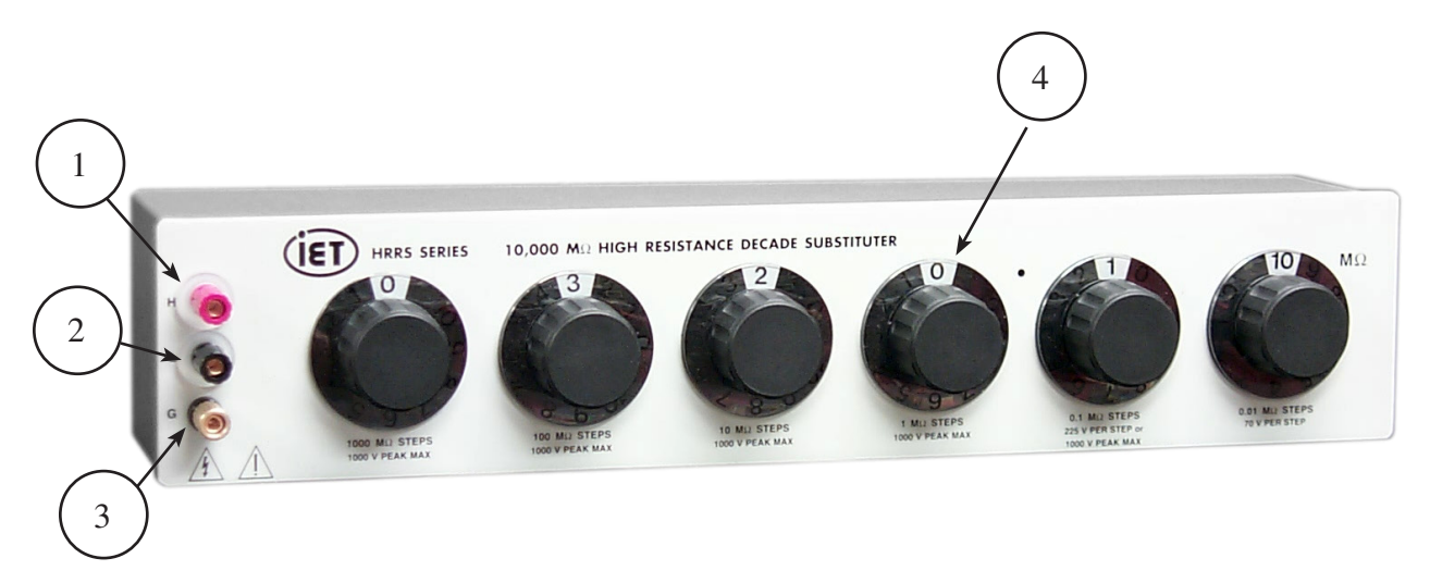
Figure 4-2: Replaceable Parts